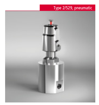
Pneumatically operated servo-controlled valve up to 300 bar for the use in the hydrogen.