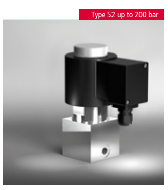
Directly controlled solenoid valve to lock hydrogen and reformates in fuel cell applications as well as for use in electrolyzers.

· Original products may vary from the product photographs due to deviating materials etc. Errors excepted, subject to change.