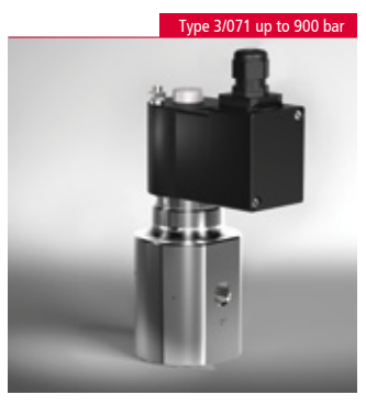
Pilot operated solenoid valve to shut off high pressure lines using UNF autoclaves. Particularly suitable for the 700 bar hydrogen tank system technology.