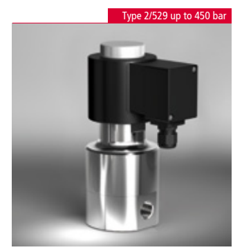
Pilot operated solenoid valve for use in hydrogen applications e.g. for tank systems for forklift trucks.